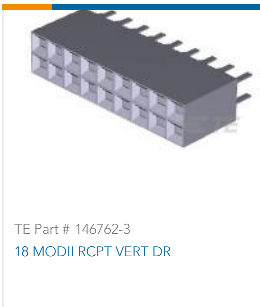
TE Part # 146762-3 18 MODII RCPT VERT DR